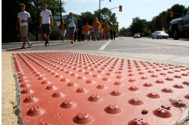
Photo of new detectable warning surface at road crossing.