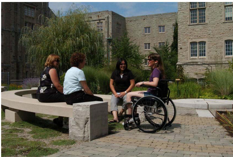
Western is committed to achieving barrier-free accessibility for all who study, work at or visit our campus.